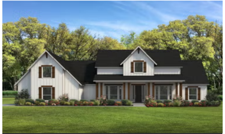
Elevation C | The Woodland GR