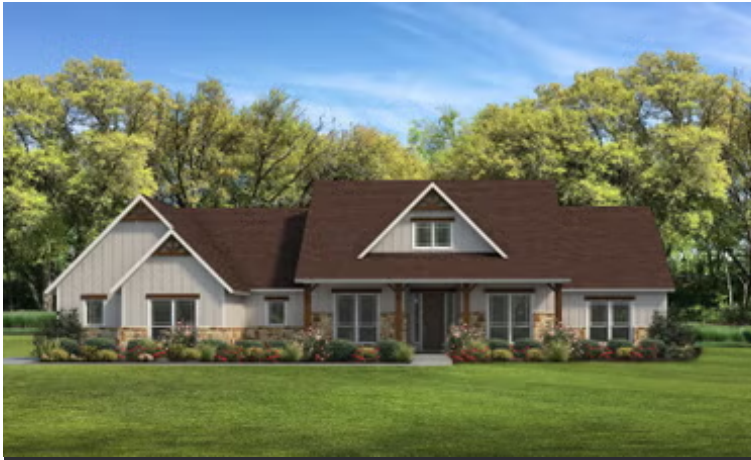
Elevation D | The Woodland GR