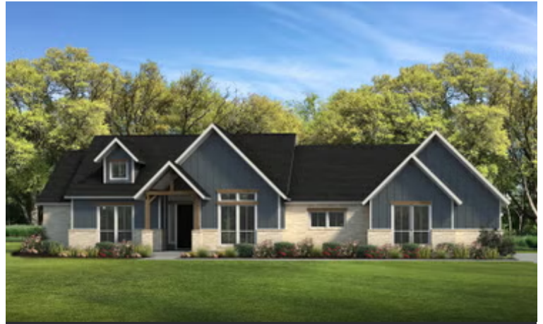
Elevation D | The Palo Duro GR