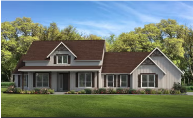
Elevation C | The Palo Duro GR