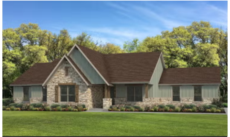
Elevation D | The Livingston GR