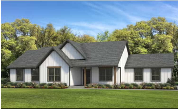
Elevation C | The Livingston GR