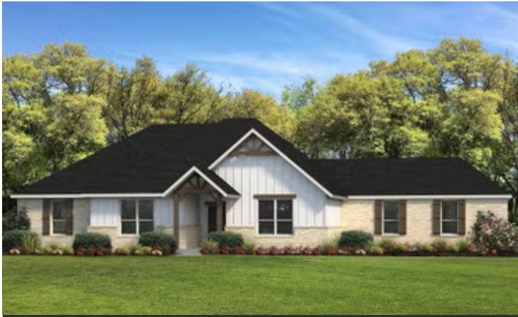
Elevation D | The Canyon GR