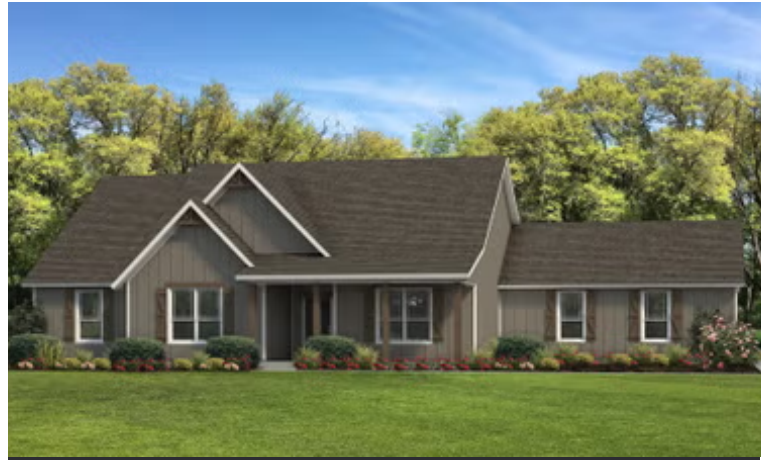
Elevation C | The Canyon GR