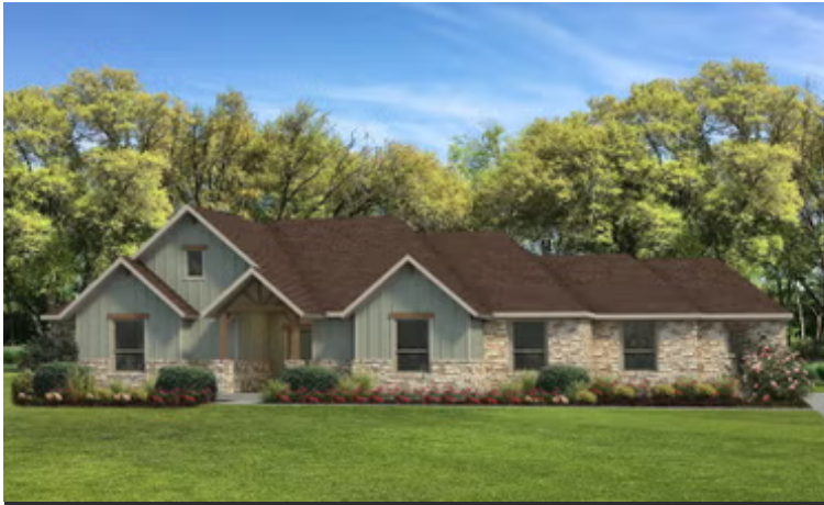
Elevation D | Brazoria GR