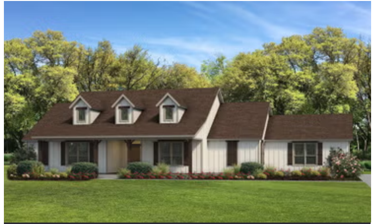
Elevation C | Brazoria GR