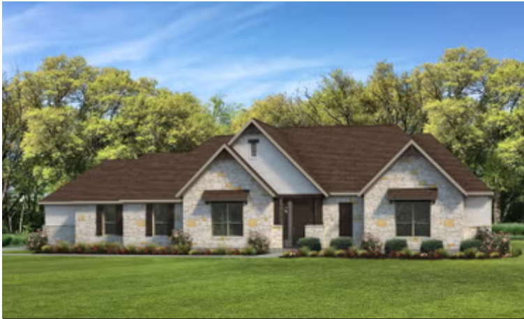
Elevation D | The Barton Springs GR