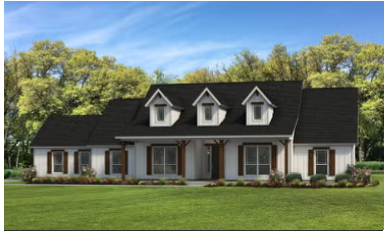
Elevation C | The Barton Springs GR