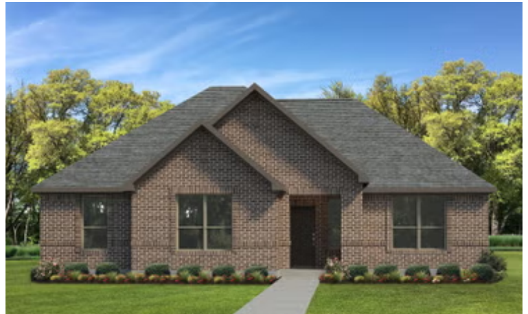
Elevation A - The Whitney