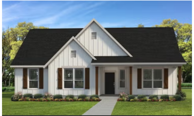
Elevation C - The Whitney