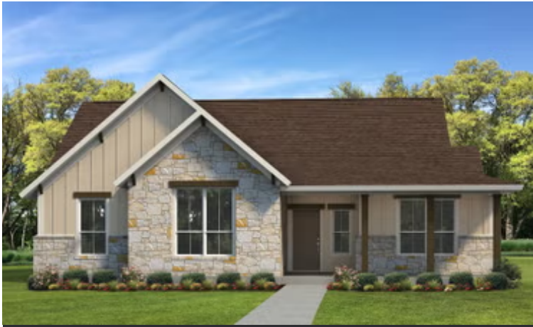
Elevation D - The Whitney