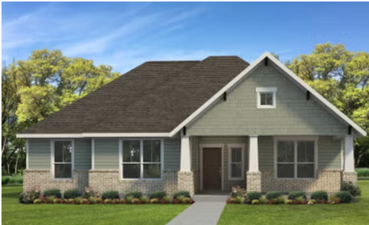
Elevation B - The Whitney