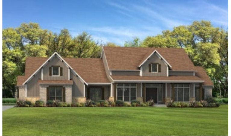
Elevation C | The Lone Star