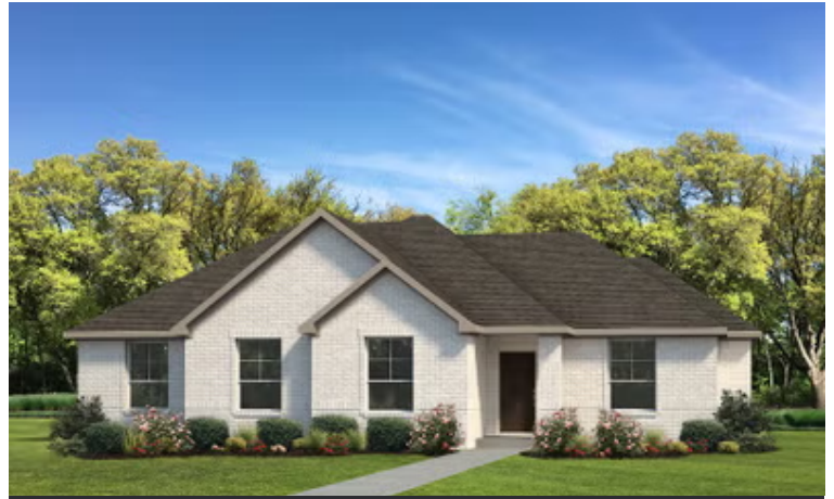
Elevation B - The Gonzales