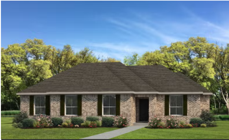
Elevation A - The Gonzales