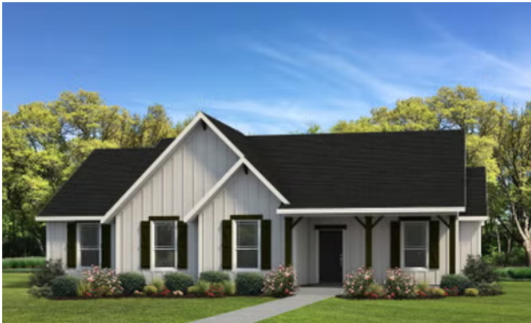
Elevation C - The Gonzales