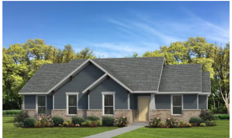
Elevation D - The Gonzales