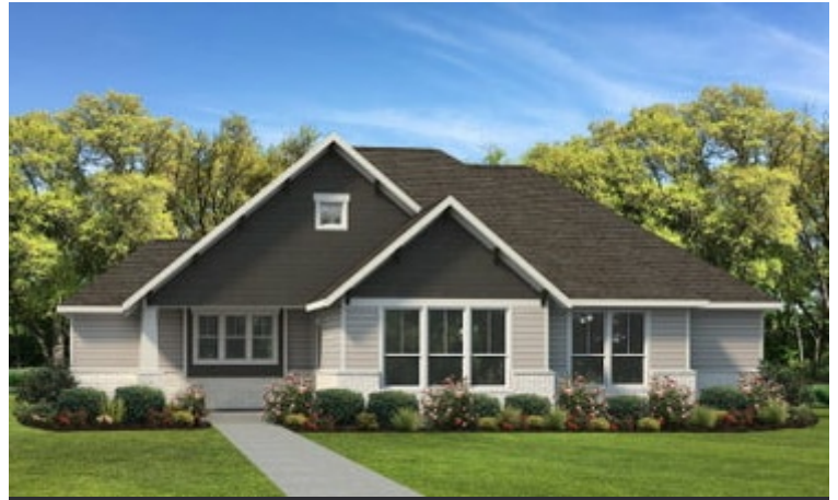
Elevation B | The Arlington