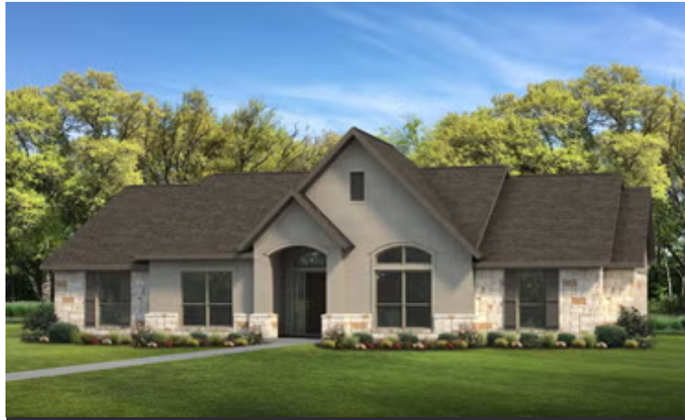
Elevation B | The Magnolia