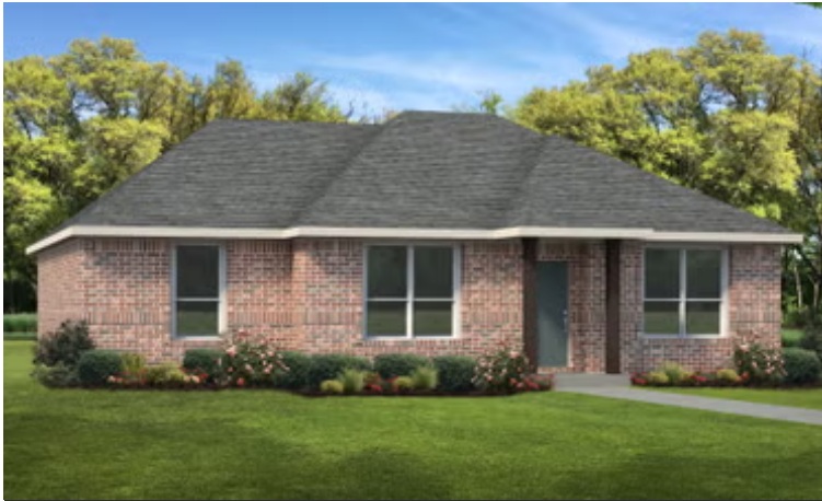
Elevation A - The Rio