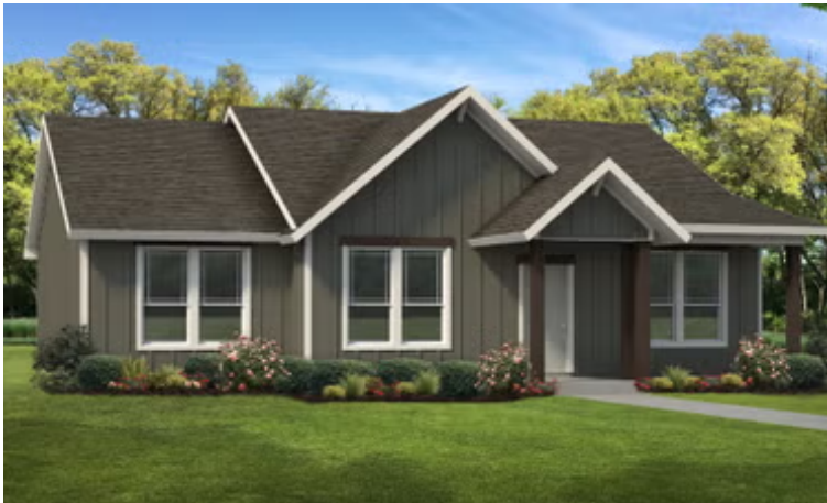
Elevation C - The Rio