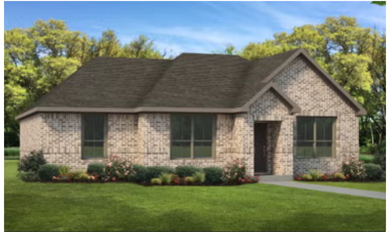
Elevation B - The Rio