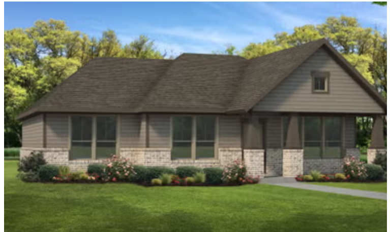
Elevation D - The Rio