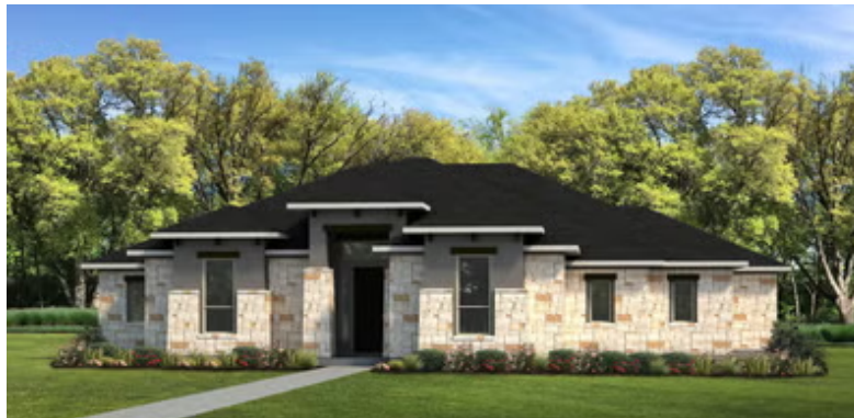
Elevation E | The Palo Duro