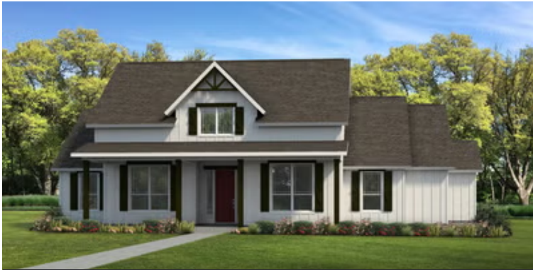
Elevation C | The Palo Duro