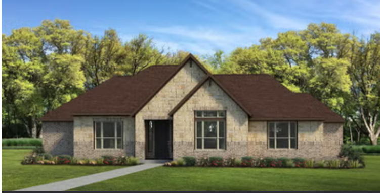
Elevation A | The Palo Duro