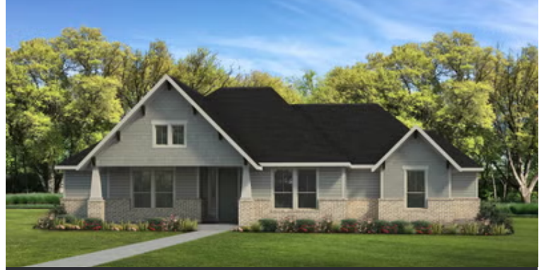
Elevation B | The Palo Duro