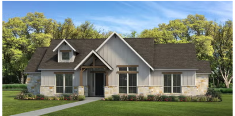
Elevation D | The Palo Duro