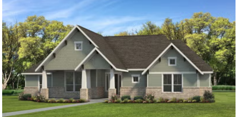
Elevation B | The Barton Springs