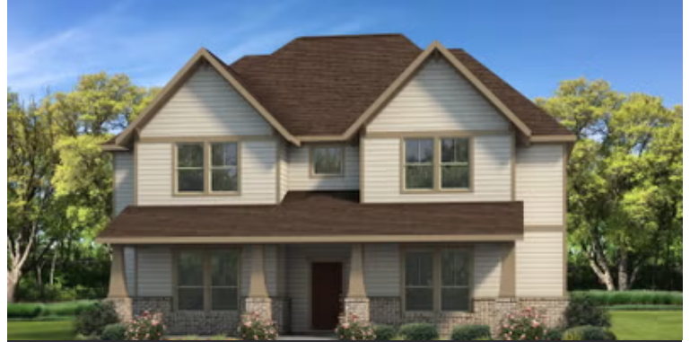
Elevation B | The Granbury