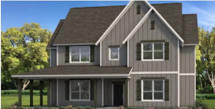
Elevation C | The Granbury