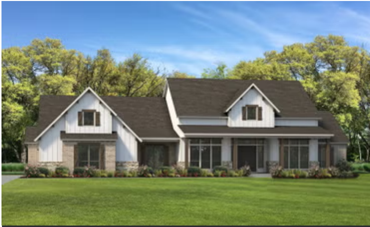
Elevation C | The Lone Star GR