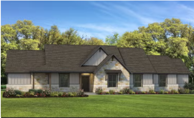
Elevation D | The Cisco GR