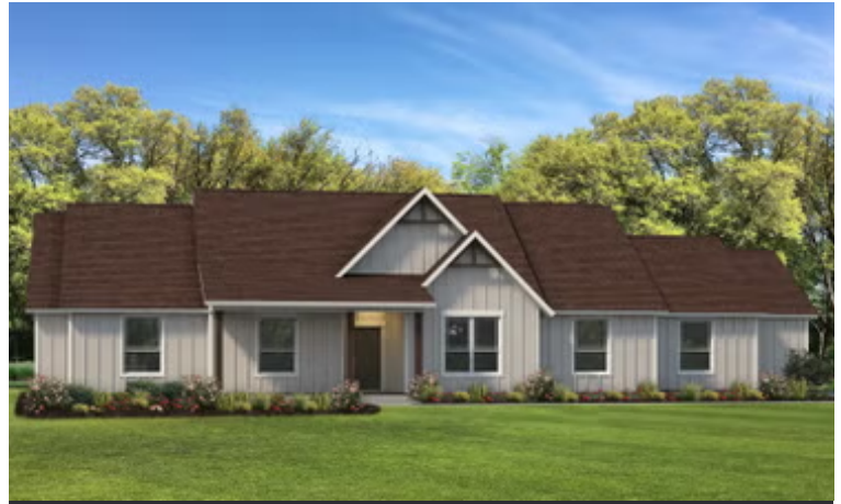
Elevation C | The Cisco GR