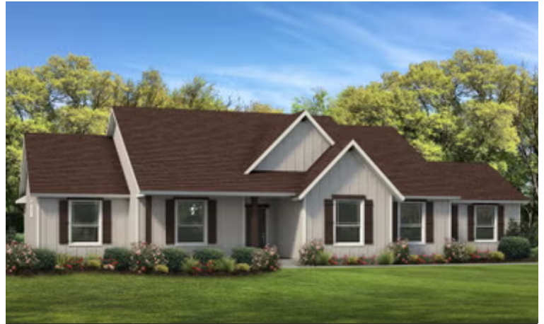
Elevation C | The Angelina GR