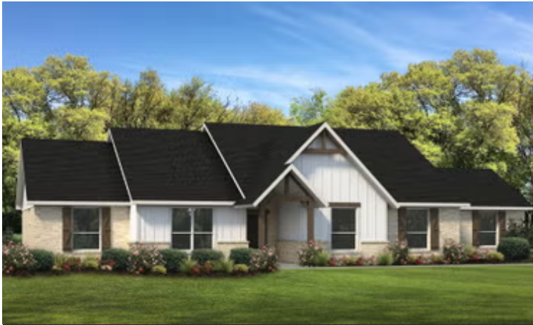
Elevation D | The Angelina GR