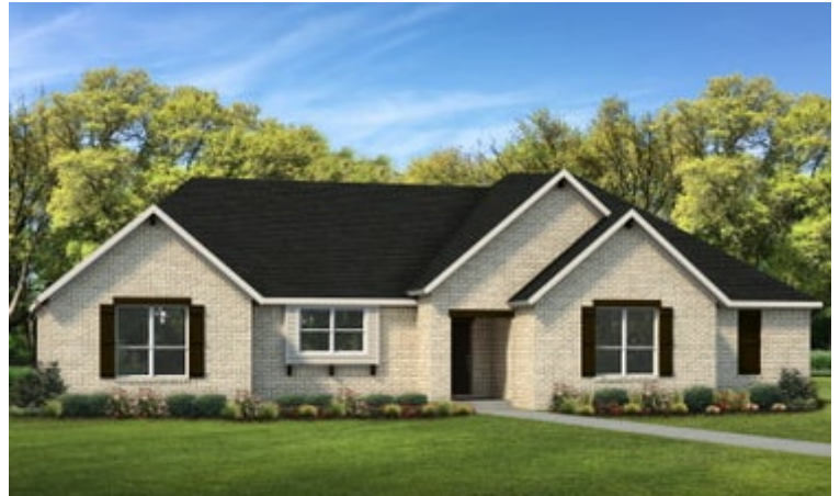
Elevation A | The Abilene