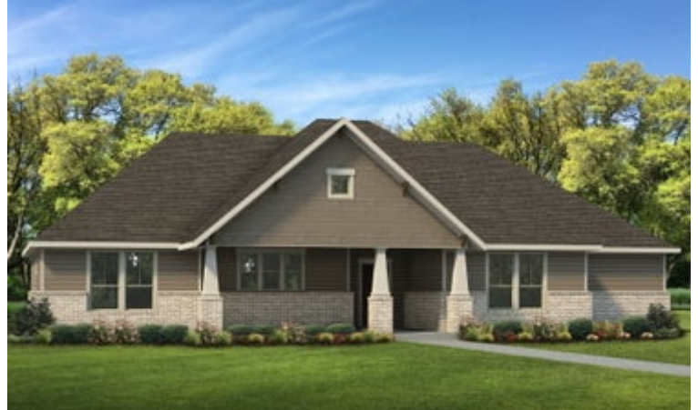
Elevation B | The Abilene