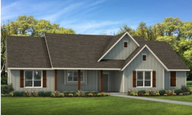
Elevation C | The Abilene