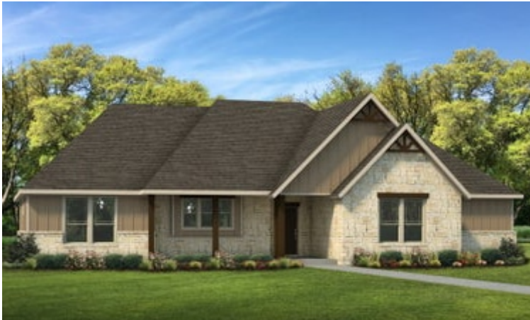
Elevation D | The Abilene