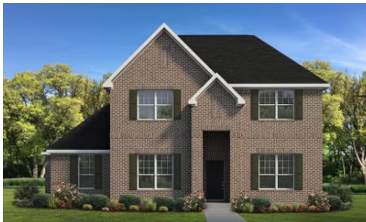
Elevation A | The Cedar Creek