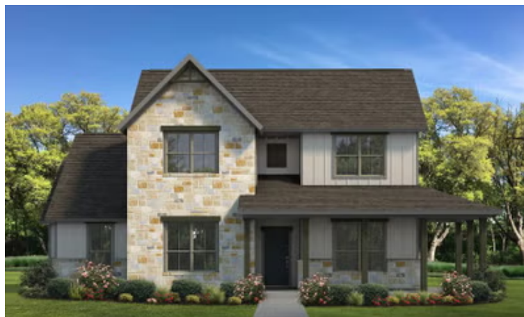
Elevation D | The Cedar Creek