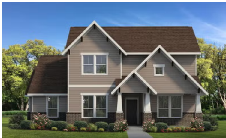
Elevation B | The Cedar Creek