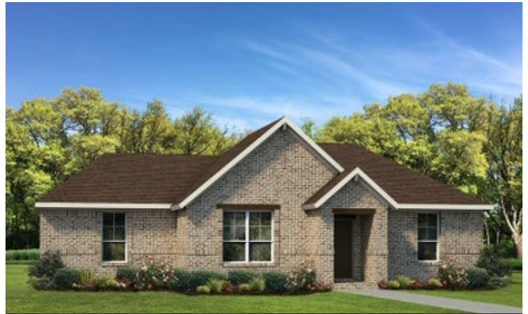
Elevation B - The Harrisburg