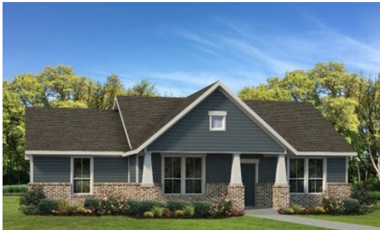
Elevation D - The Harrisburg