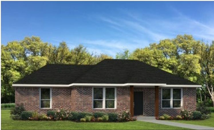
Elevation A - The Harrisburg