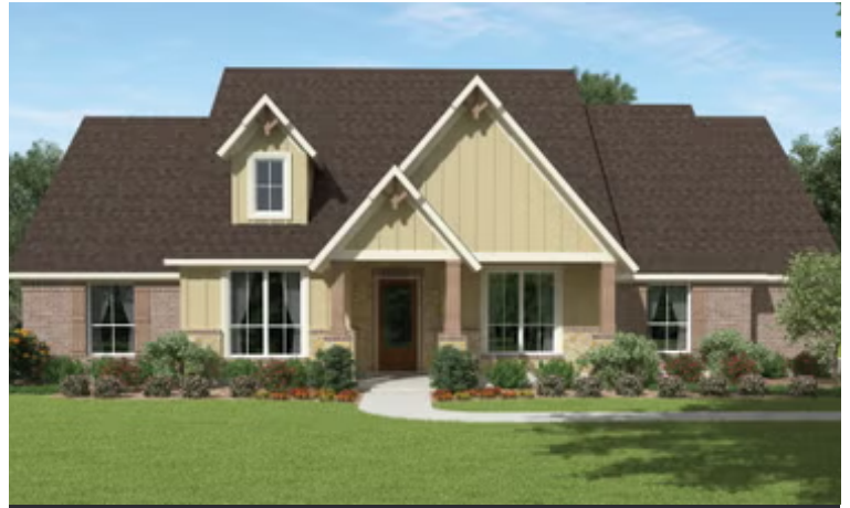
Elevation C - The Rockwall