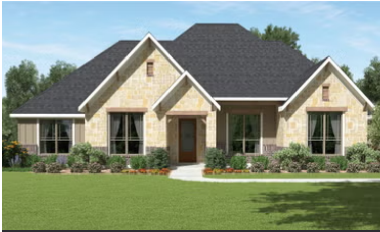
Elevation B - The Rockwall