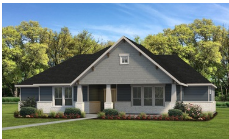
Brazoria B | Front Exterior