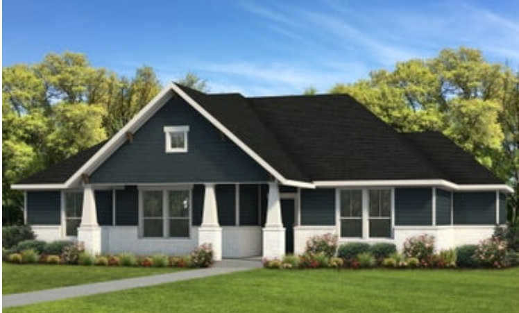
Elevation B | The Canyon