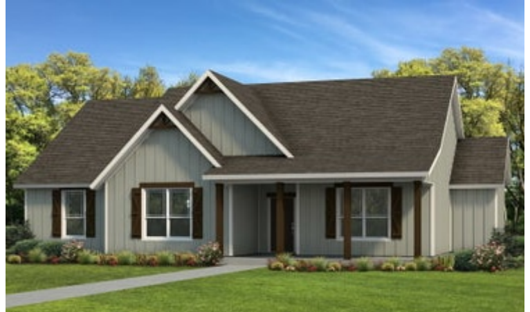
Elevation C | The Canyon