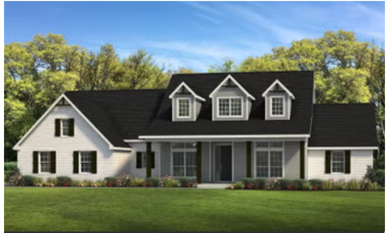
Elevation C - The Fredericksburg