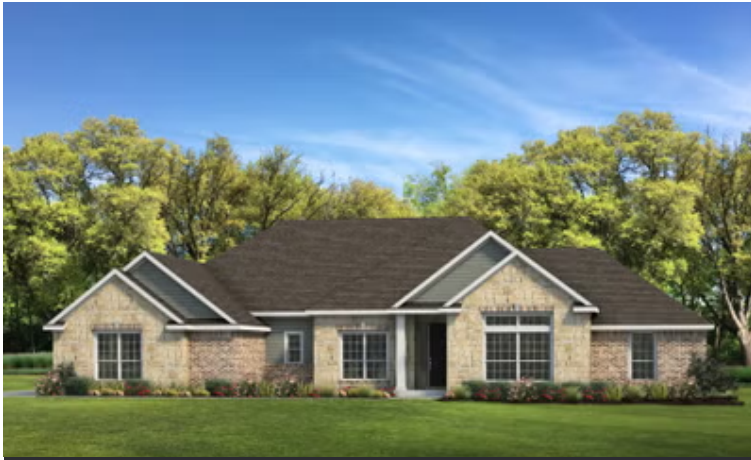
Elevation B - The Fredericksburg