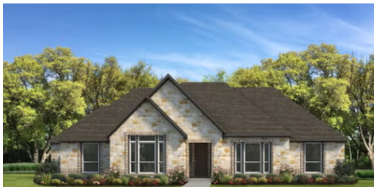
Elevation A | The Woodland