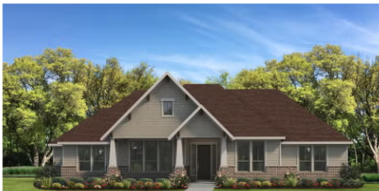
Elevation B | The Woodland