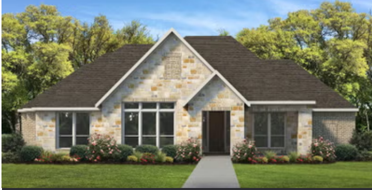
Elevation A - The Fayetteville