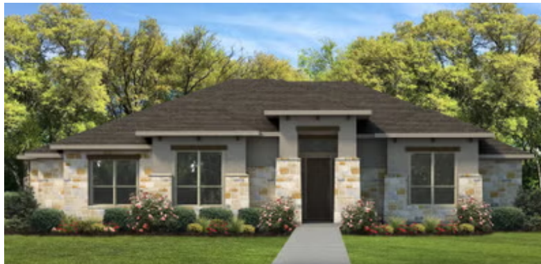
Elevation E - The Fayetteville