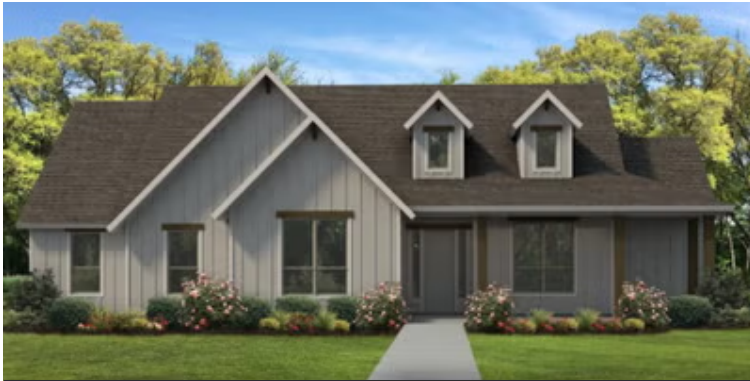
Elevation C - The Fayetteville