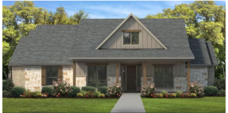
Elevation D - The Fayetteville