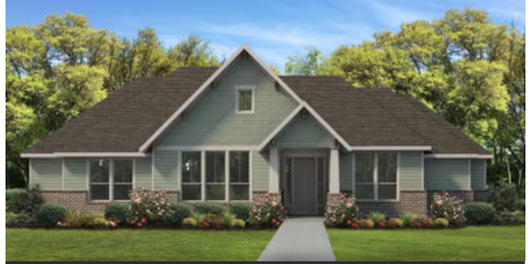
Elevation B - The Fayetteville