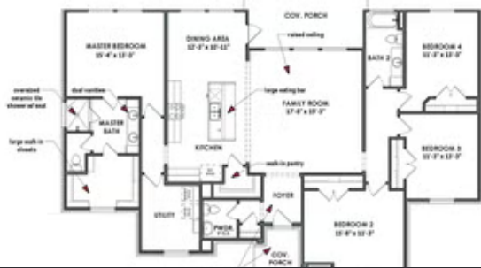
Floorplan - Elevation E | The Cisco