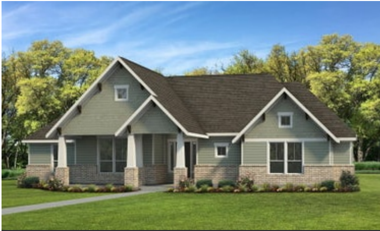
Elevation B | The Barton Springs