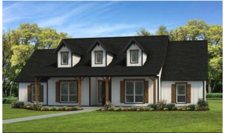
Elevation C | The Barton Springs