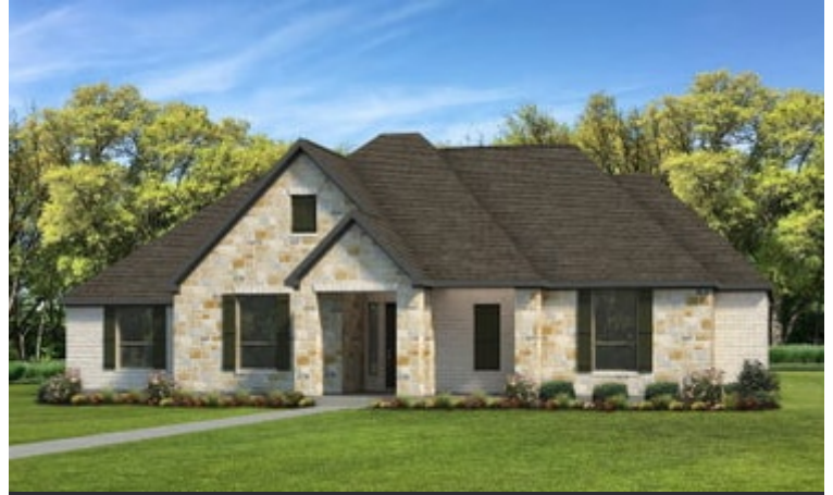
Elevation A | The Barton Springs