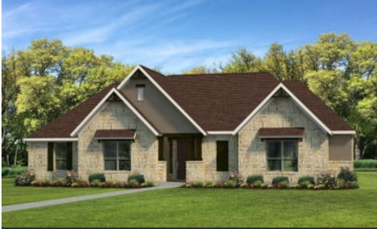
Elevation D | The Barton Springs