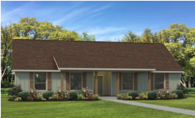
Elevation C | The Bexar