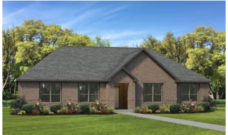
Elevation B | The Bexar