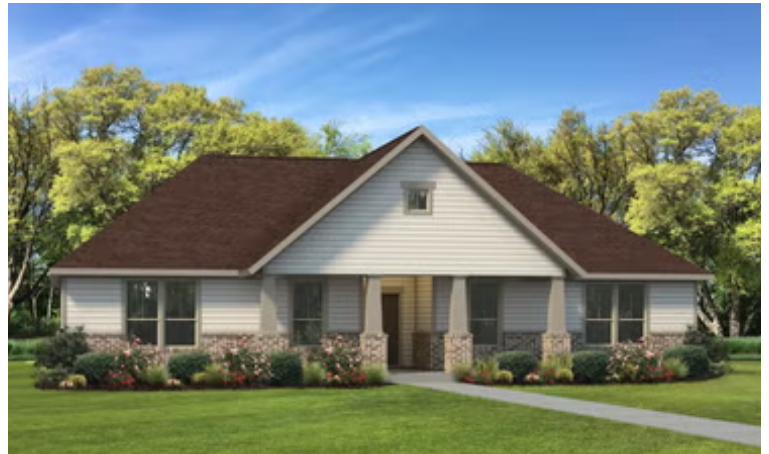
Elevation D | The Bexar