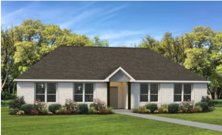
Elevation A | The Bexar