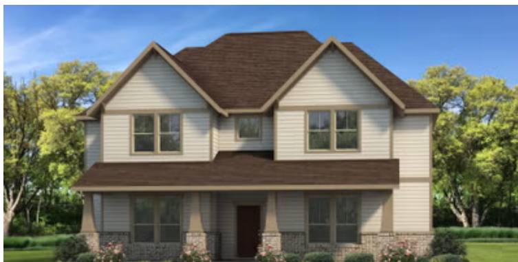
Elevation B | The Granbury