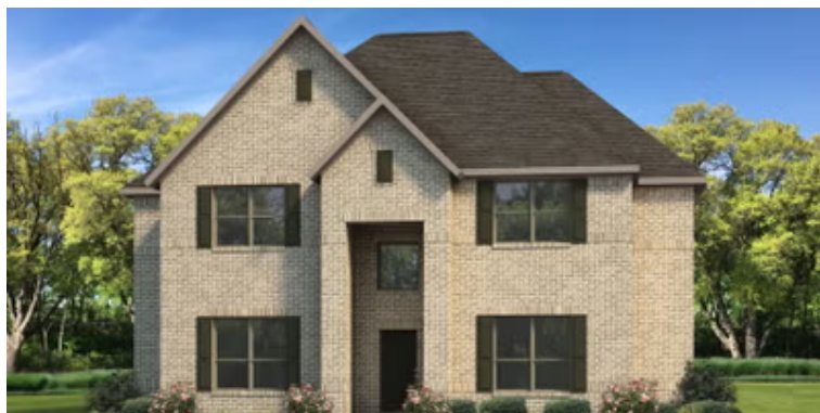
Elevation A | The Granbury