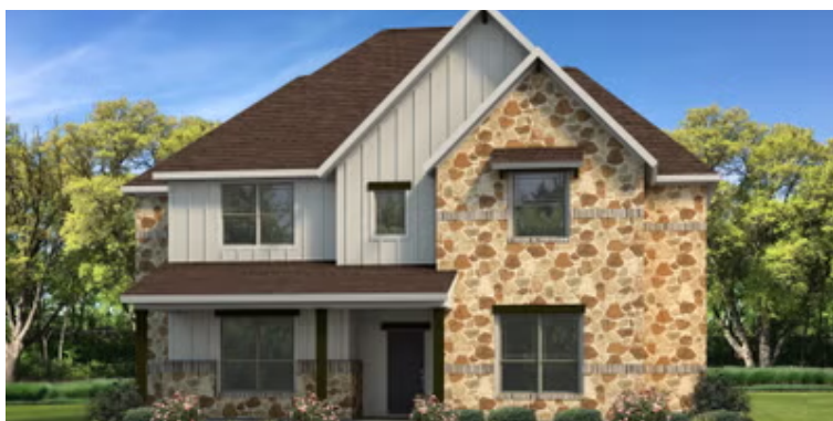
Elevation D | The Granbury