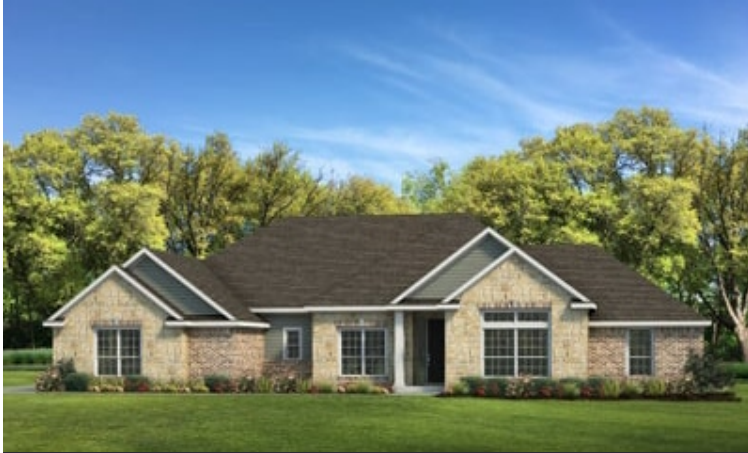
Elevation B - The Fredericksburg