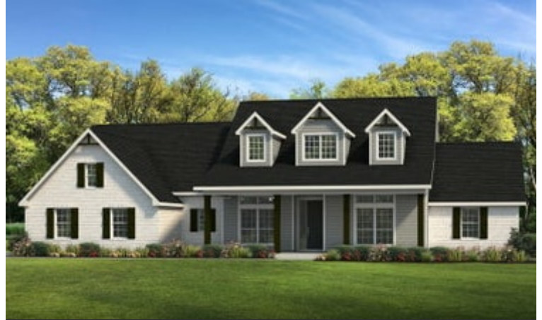
Elevation C - The Fredericksburg