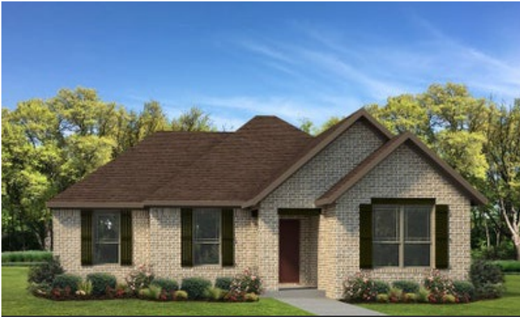
Elevation B - The Floresville