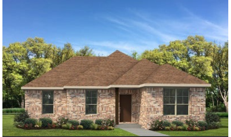
Elevation A - The Floresville