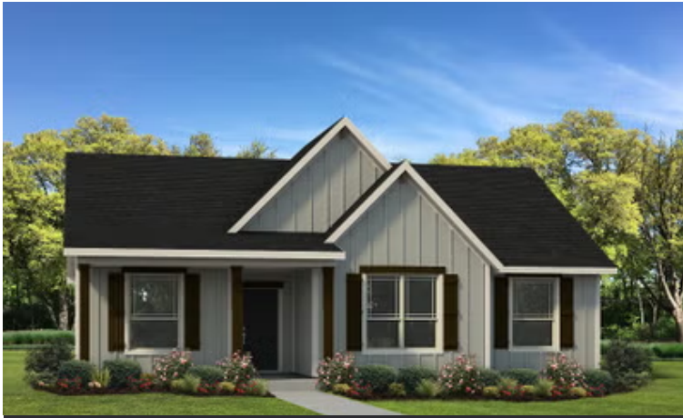
Elevation C - La Porte