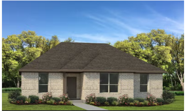
Elevation A - La Porte