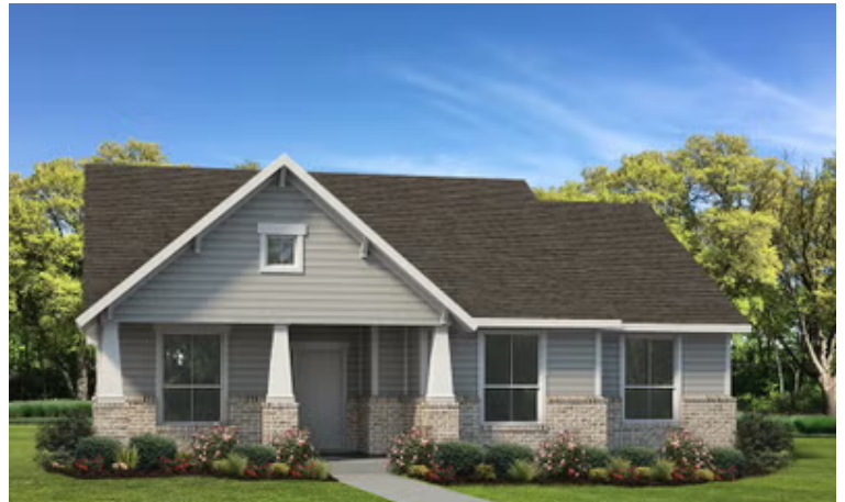
Elevation D - La Porte