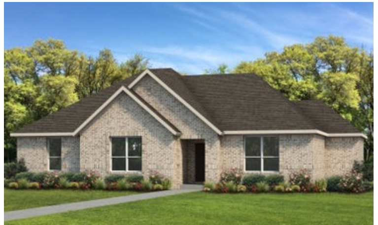
Elevation A | The Canyon