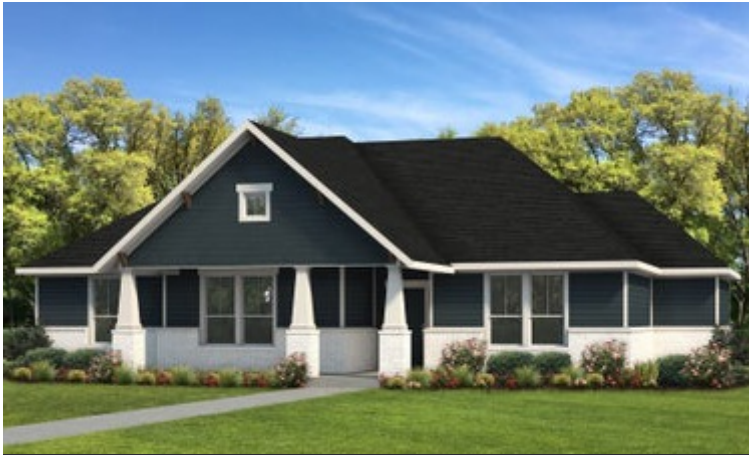
Elevation B | The Canyon