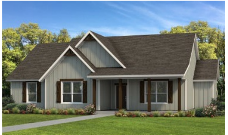
Elevation C | The Canyon