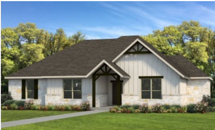
Elevation D | The Canyon