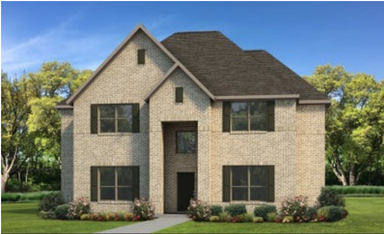
Elevation A | The Granbury