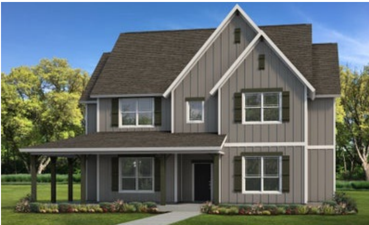
Elevation C | The Granbury