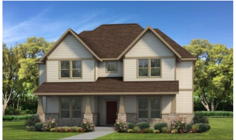
Elevation B | The Granbury