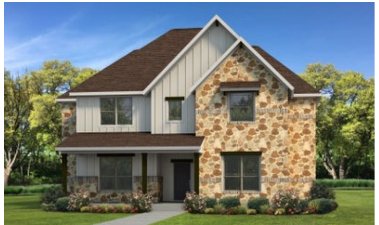
Elevation D | The Granbury