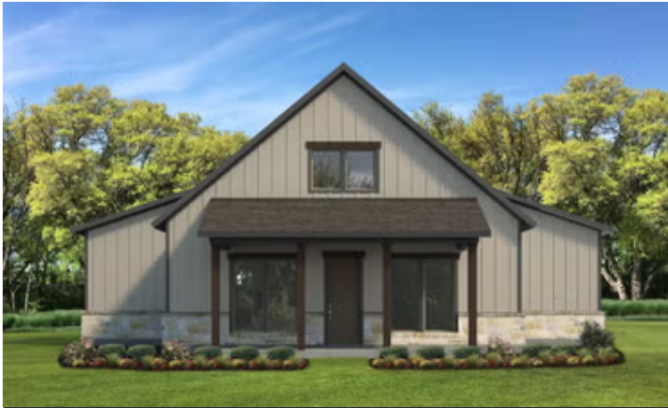
Front Exterior - Ranger A | Rendered Home - May Contain Upgraded Design Options