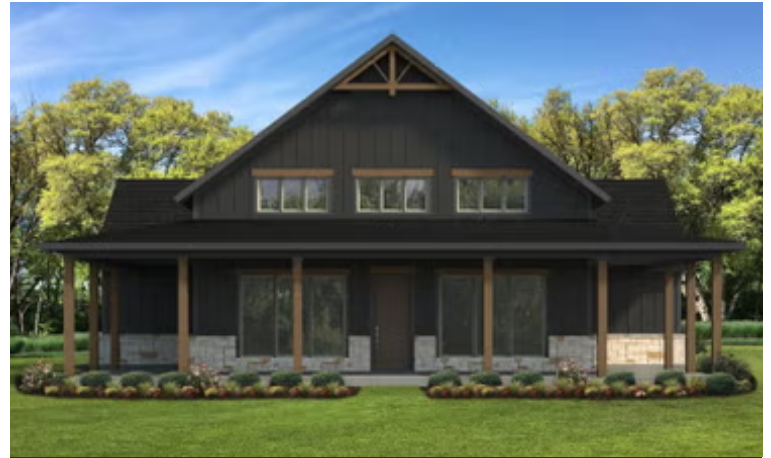
Front Exterior - Ranger B | Rendered Home - May Contain Upgraded Design Options