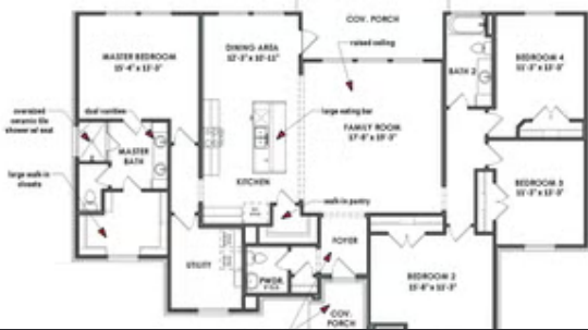
Floorplan - Elevation E | The Cisco