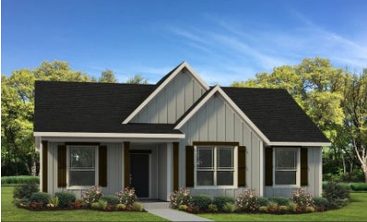
Elevation C - La Porte