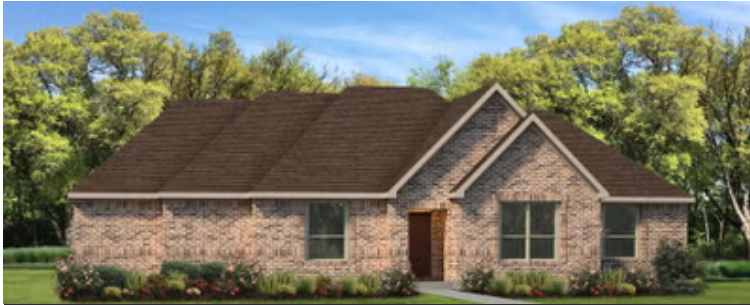
Elevation A | The Cisco