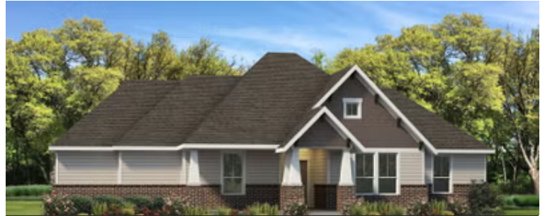
Elevation B | The Cisco