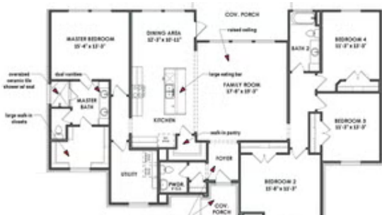
Floorplan - Elevation E | The Cisco