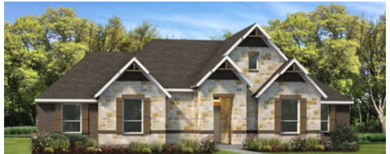
Elevation E | The Cisco