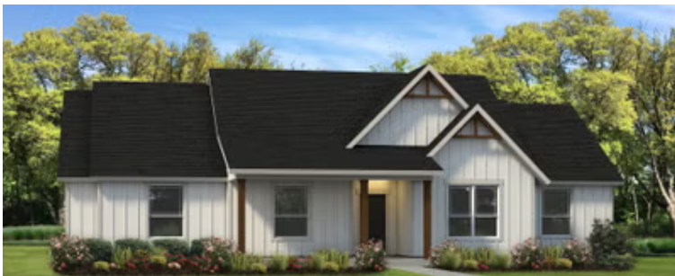
Elevation C | The Cisco