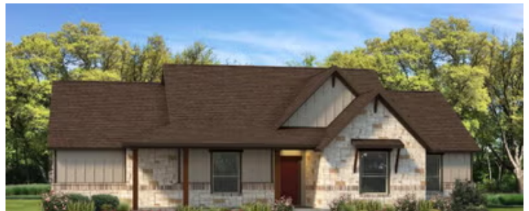
Elevation D | The Cisco