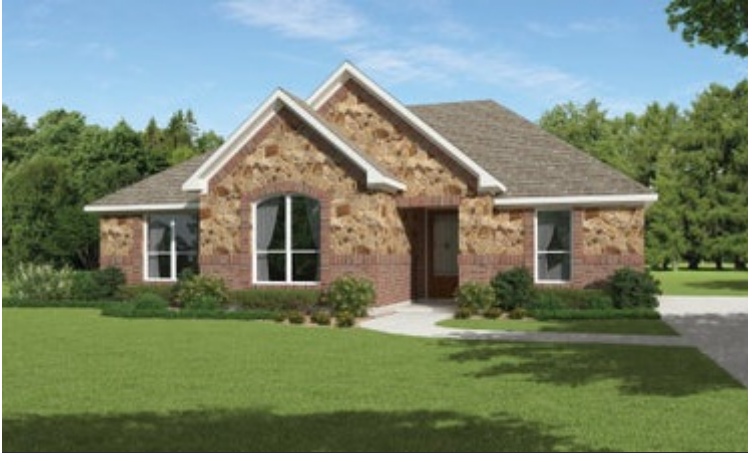
Elevation E - The Crockett