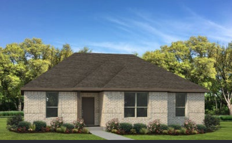
Elevation A - La Porte