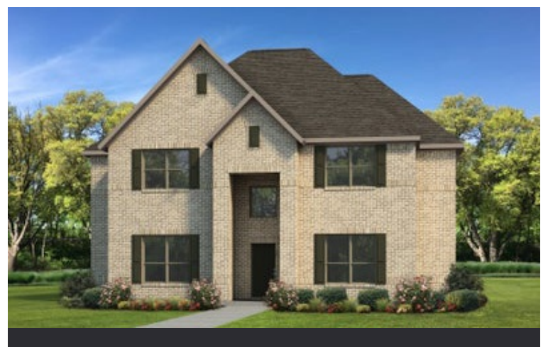
Elevation A | The Granbury