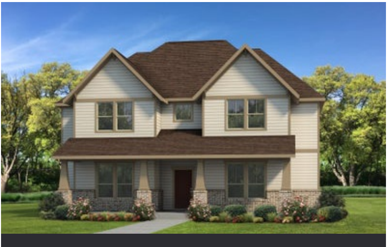
Elevation B | The Granbury