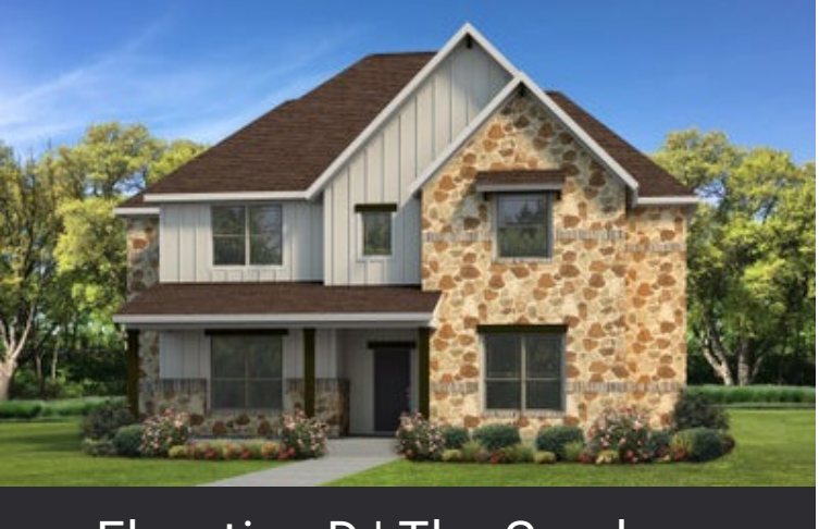
Elevation D | The Granbury