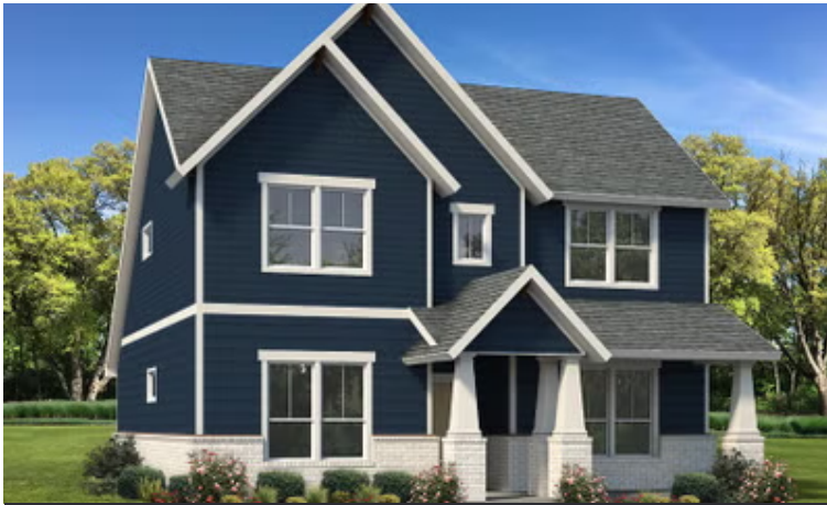
Elevation D - The Goliad