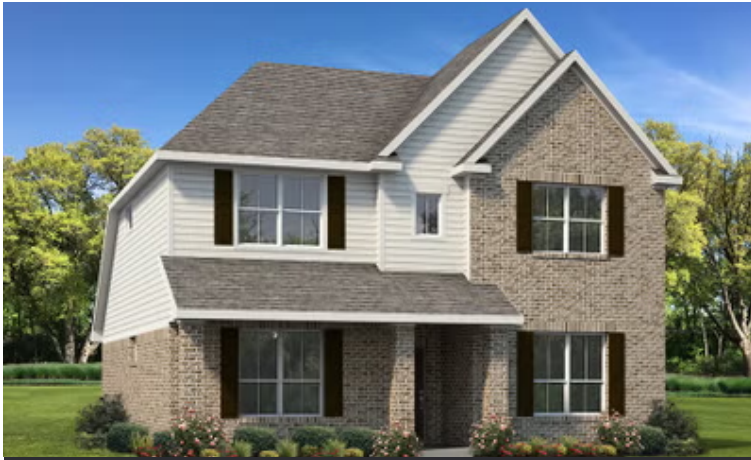
Elevation B - The Goliad