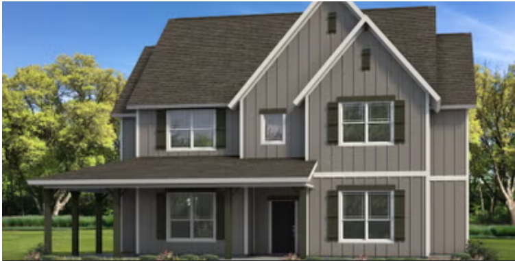
Elevation C | The Granbury