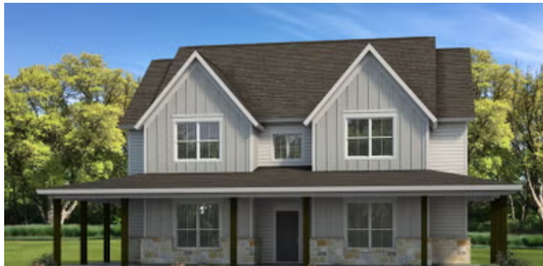
Elevation E | The Granbury