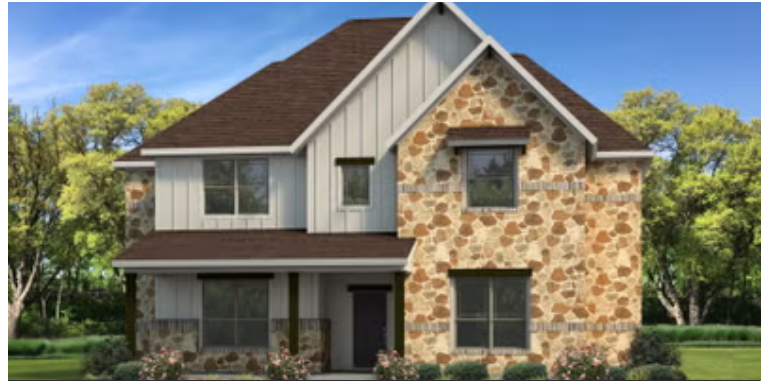
Elevation D | The Granbury