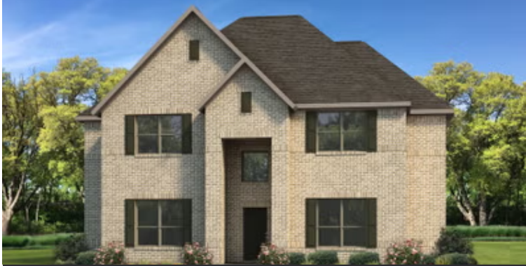
Elevation A | The Granbury