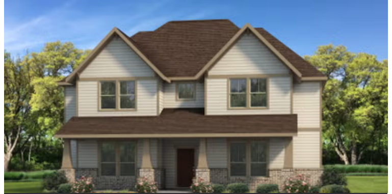
Elevation B | The Granbury