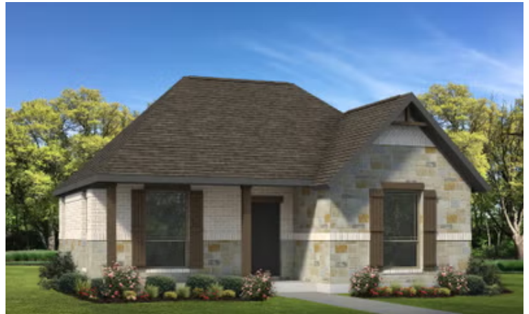
Elevation D | The Casita