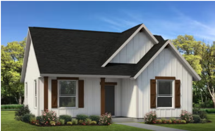
Elevation C | The Casita