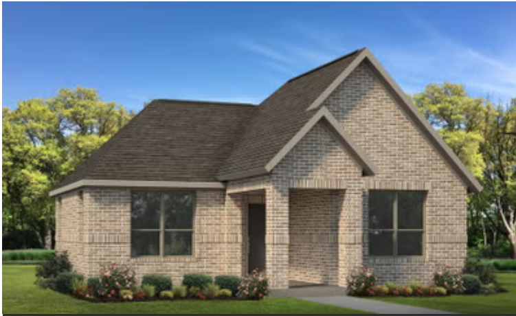
Elevation A | The Casita