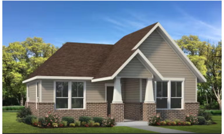
Elevation B | The Casita