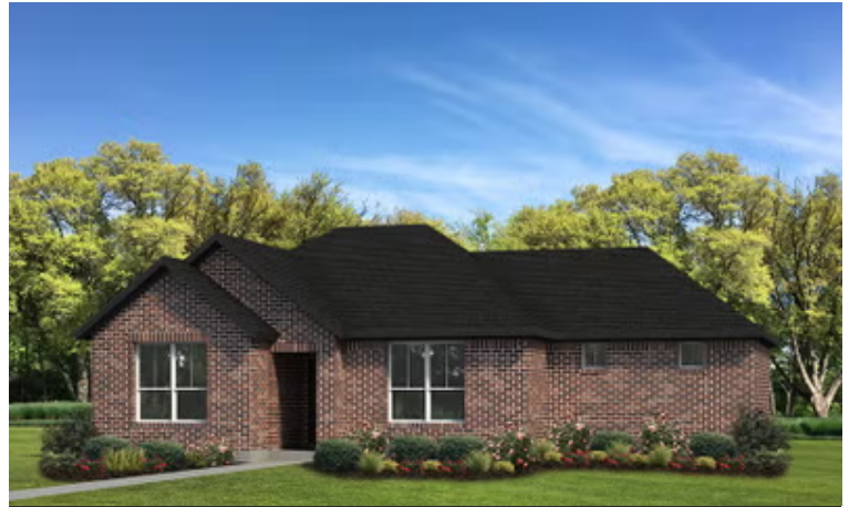
Elevation B - The Velasco