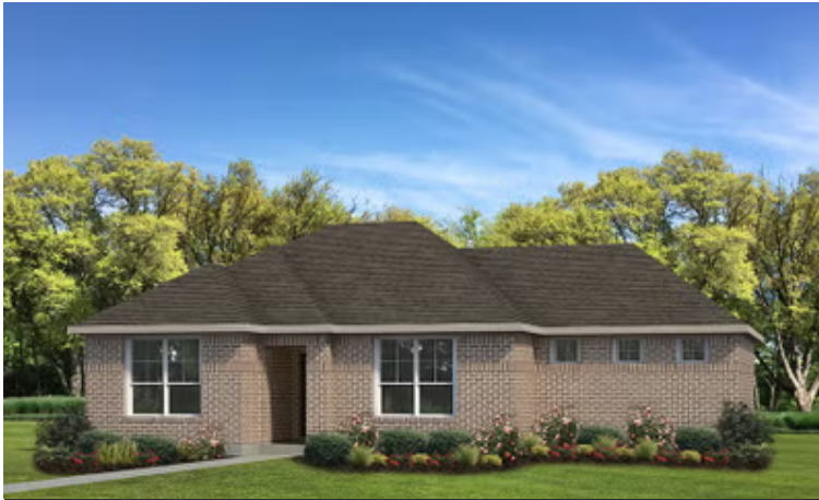
Elevation A - The Velasco