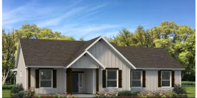
Elevation C - The Tampico