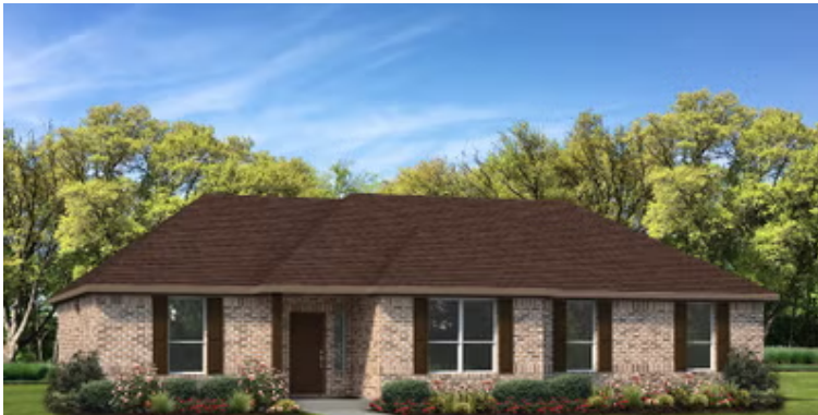
Elevation A - The Tampico