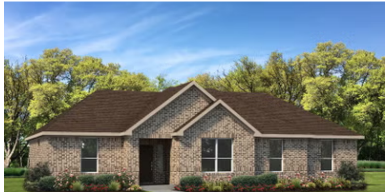
Elevation B - The Tampico