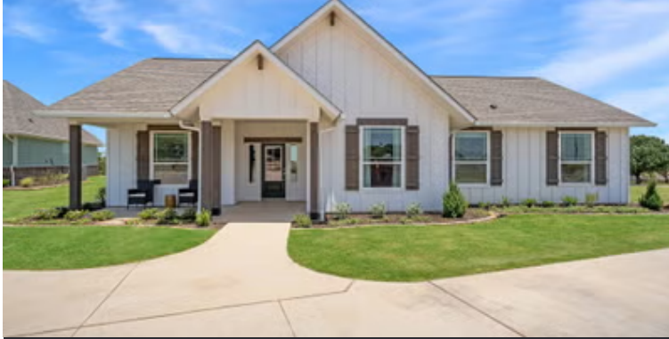
Elevation C - The Tampico | Model Located in Waco - May Contain Upgrades