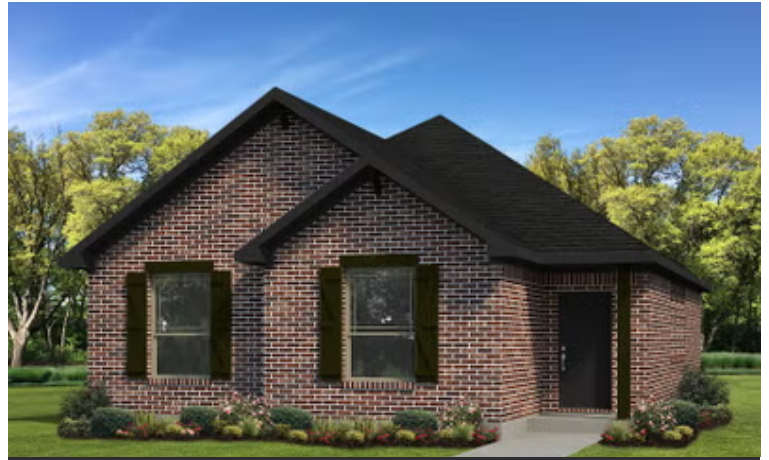
Elevation B - The San Felipe