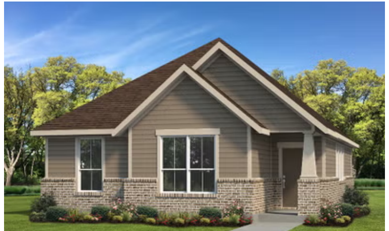
Elevation D - The San Felipe