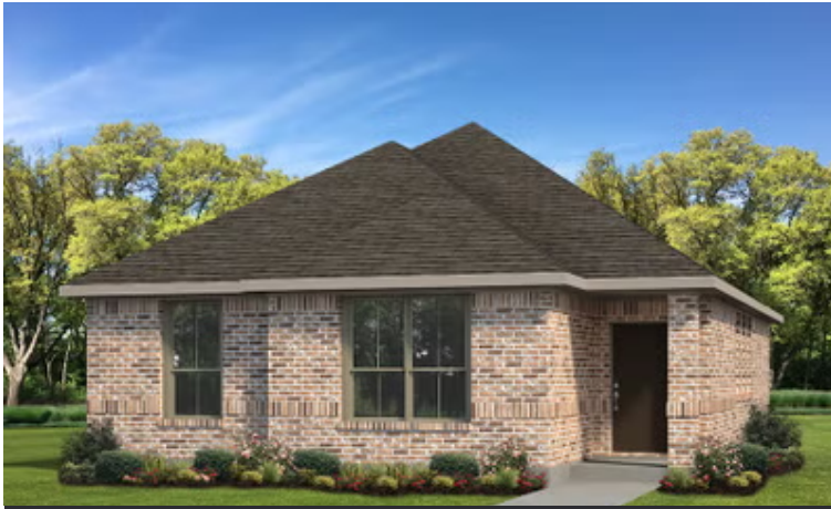
Elevation A - The San Felipe