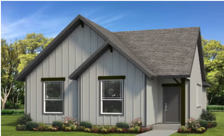
Elevation C - The San Felipe