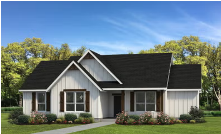
Elevation C - The Nacogdoches