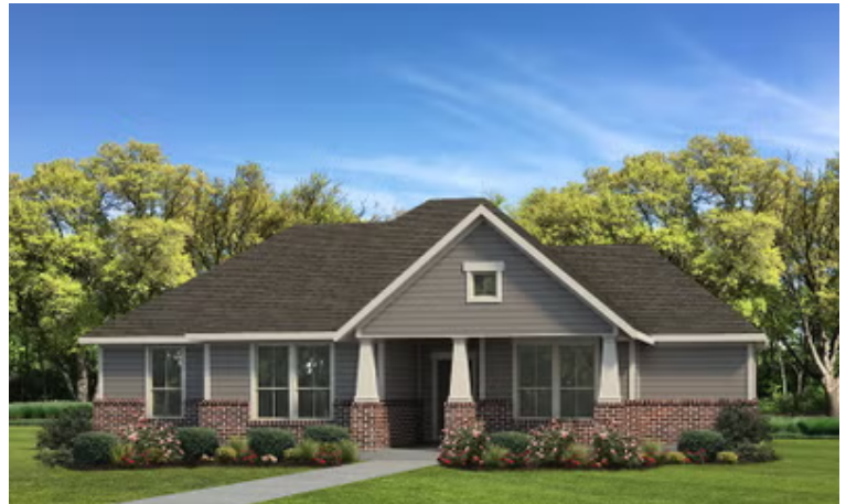
Elevation D - The Nacogdoches