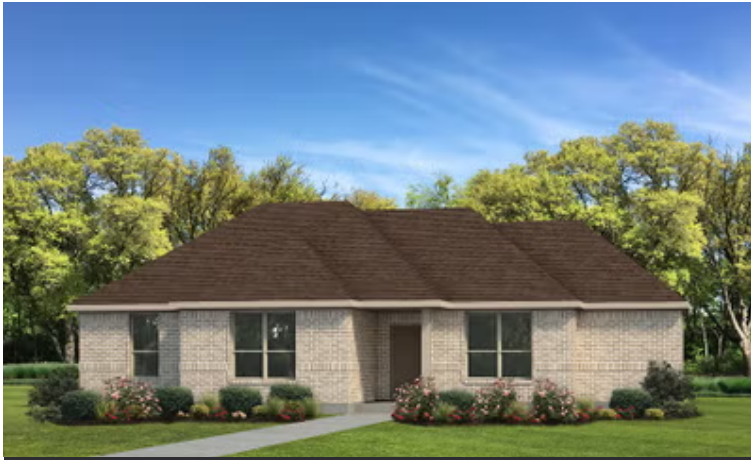
Elevation A - The Nacogdoches