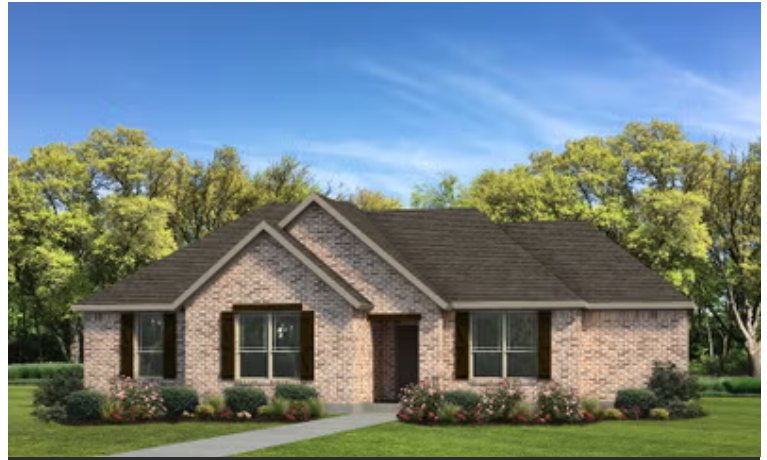
Elevation B - The Nacogdoches